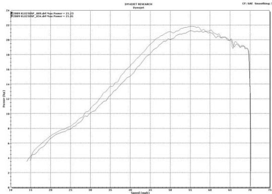
This graph shows a typical gain with a Dynojet jet kit.

Both stages may be used with a good aftermarket exhaust