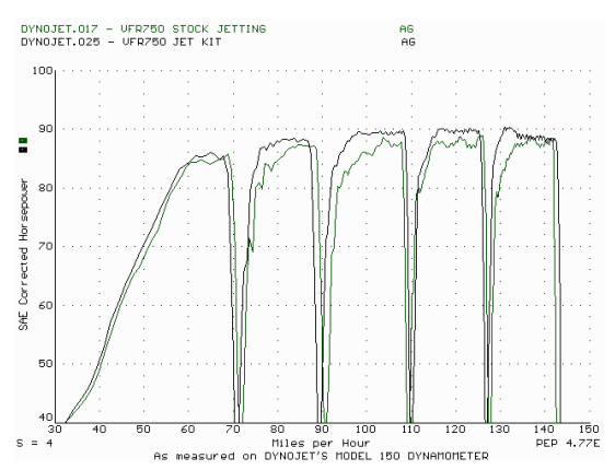
This graph shows a typical gain with a Dynojet jet kit.

For mildly tuned machines using the stock airbox, with stock or K&N filter. May also be used with a good aftermarket exhaust system K&N filter #HA-7587