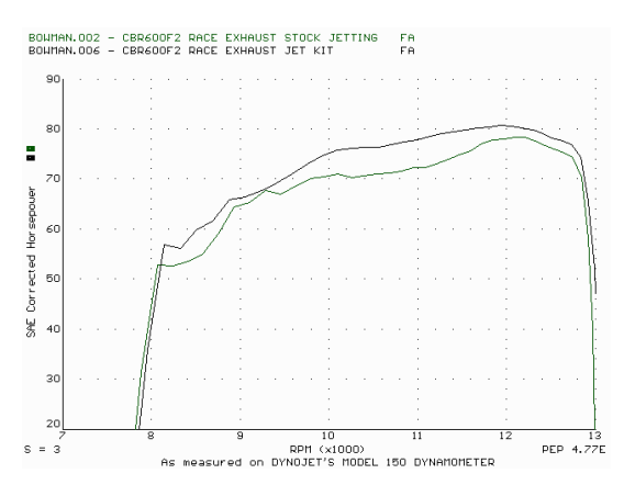
This graph shows a typical gain with a Dynojet jet kit.

For mildly tuned machines using the stock airbox, with stock or K&N filter. May also be used with a good aftermarket exhaust system K&N filter #HA-6091