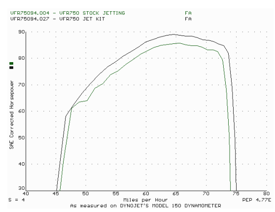
This graph shows a typical gain with a Dynojet jet kit.

For mildly tuned machines using the stock airbox, with stock or K&N filter. May also be used with a good aftermarket exhaust system K&N filter #HA-0003