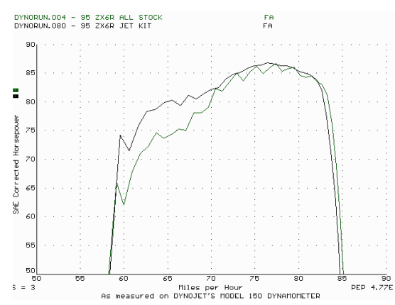
This graph shows a typical gain with a Dynojet jet kit.

For mildly tuned machines using the stock airbox, with stock or K&N filter. May also be used with a good aftermarket exhaust system K&N filter #KA-0025